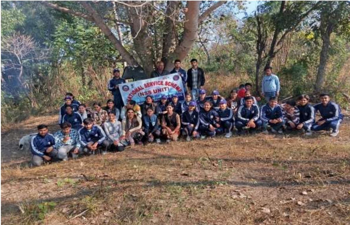
Students of NSS Unit

Presently the college has two NSS Units comprising of 100 students. 33% seats are reserved for the girls. Students who attend 240 hours of social service and attend “7 days” special camp are given the weightage of 2% marks at the time of admission in P.G Courses of H.P. University.