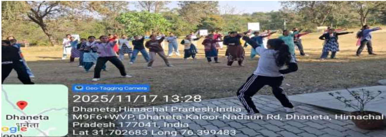
Students Participating in a Two Week Self Defense Training Programme

Note: Internal assessment will be given on the basis of the class test, surprise quiz competitions, Presentations, class participation & attendance.