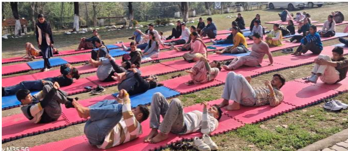
Students Participating in One Week Yoga Workshop

The maximum age limit for the course is 21 years for male candidates of General Category, 23 years for female candidates of General category and 24 years for both male and female candidates of Scheduled Caste/ Scheduled Tribe category as on 1st July 2026 of the year concerned. The Vice-Chancellor may permit age relaxation up to maximum of three months.