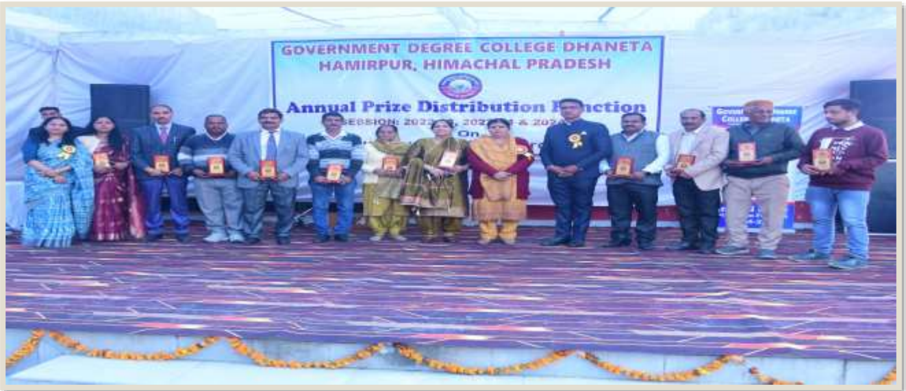
ANNUAL PRIZE DISTRIBUTION FUNCTION 2024-25