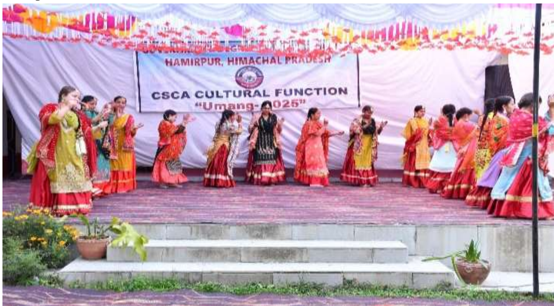
Students Participating in a CSCA Culture Function "Umang"

The college CSCA along with the college administration organize the inter faculty cultural function for students to represent their faculties.