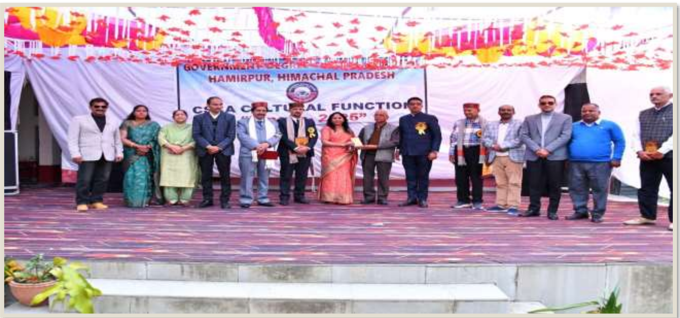
CSCA CULTURAL FUNCTION 2025-26